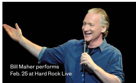
Bill Maher performs Feb. 25 at Hard Rock Live