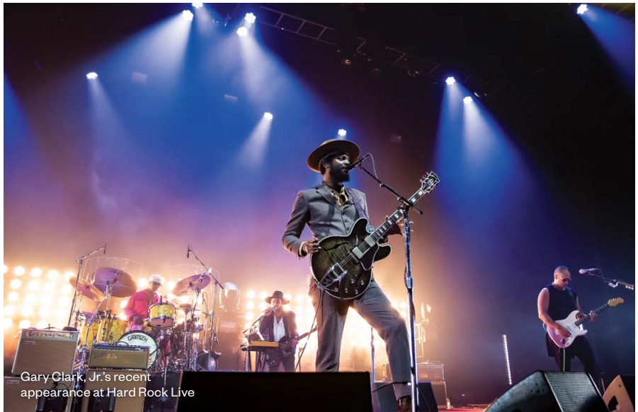
Gary Clark, Jr.'s recent appearance at Hard Rock Live

very large video walls. “To me, it almost feels like a small arena.”