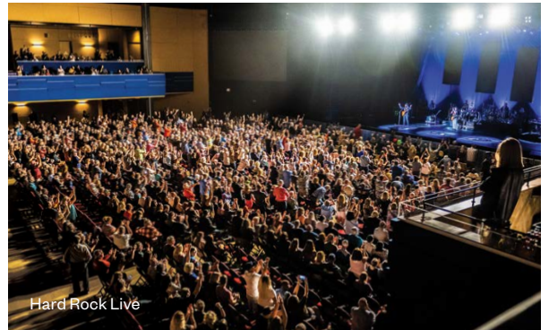
Hard Rock Live

opportunities are being created to meet the demands of the venue,” he says. “These are great jobs, living-wage jobs, with a full benefits package. It’s important to acknowledge that the money spent on the venue helps to boost the economy.”